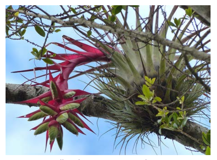
Tillandsia eizii x punctulata

This pre-conference tour will visit a number of localities and diverse habitats in the states of Oaxaca and Chiapas including oak pine forest, tropical deciduous thorn forest, desert, coastal dry forest, cloud forest, montane rain forest, and limestone mogotes. Among