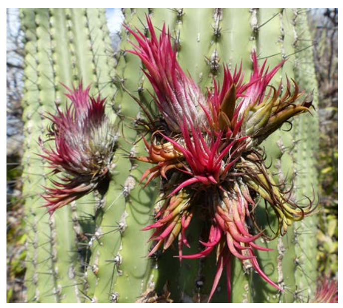
Tillandsia ionantha fastigiata

the spectacular species we intend to see are: Tillandsia xerographica, seleriana, prodigiosa, eizii, bourgaei, violacea, sierra-juarezensis, atroviridipetala, caput-medusae, lucida, punctulata, imperialis, grandis, ionantha; Hechtia lanata, rosea, lyman-smithii and many more!